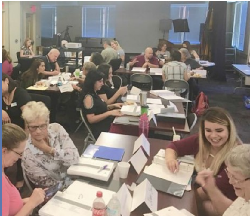
Victim Services Alliance volunteers attend a training.

The second key element of Impact Prosecution is an emphasis on the community and its experience with crime. This approach, which goes beyond traditional prosecution, improves the Office's understanding of crime and utilization of resources. The Office places victim services and prevention initiatives at the forefront of their efforts. As such, they have been administering grant money and creating multiple projects aimed at engaging community partners, addressing Adverse Childhood Experiences (ACEs), and taking a community approach to crime reduction.