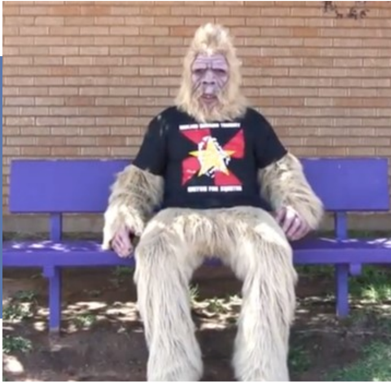
ACT program mascot Sasquatch sits on a bench at Clovis High School.

four to Dallas, Texas. The trip to Dallas includes Hurricane Harbor and Texas Ranger tickets, as well as a complimentary flight, hotel, and $500 cash stipend. Alternatively, schools will refer kids struggling to stay in school to Children Youth and Family. Juvenile Probation then meets with the student and works with the family on specific issues that may be a reason for poor attendance.